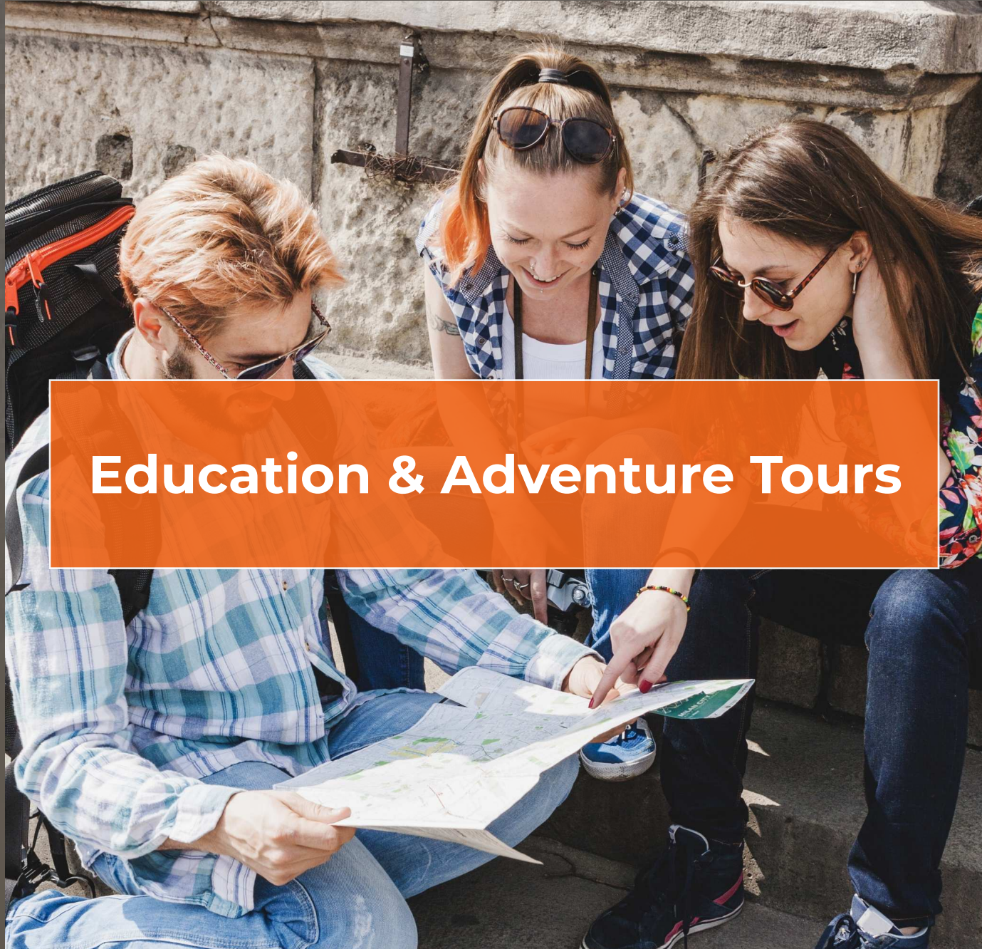
Education & Adventure Tours