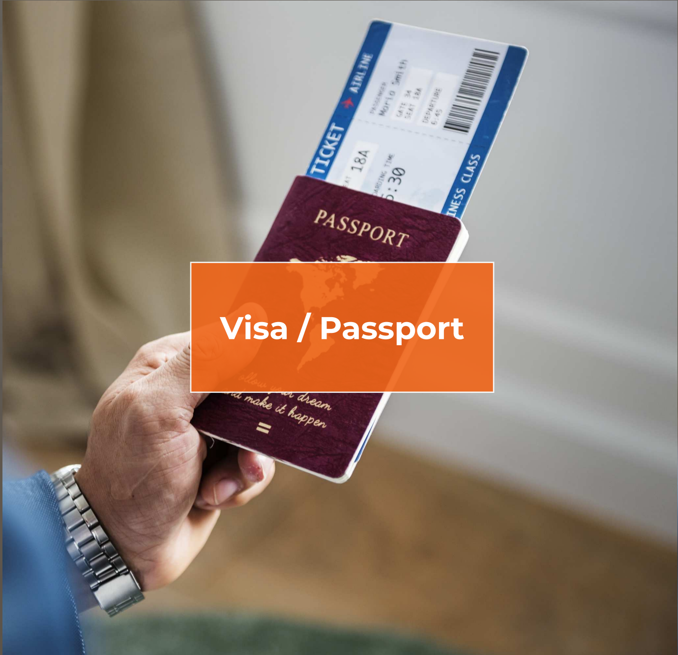
Visa / Passport